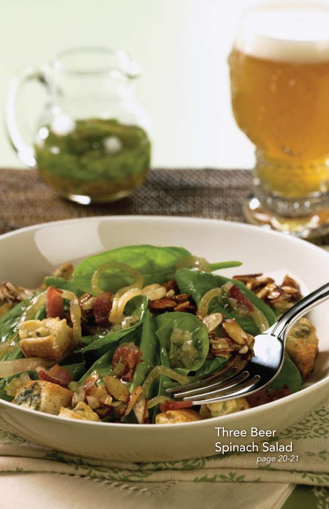
Three Beer Spinach Salad page 20-21