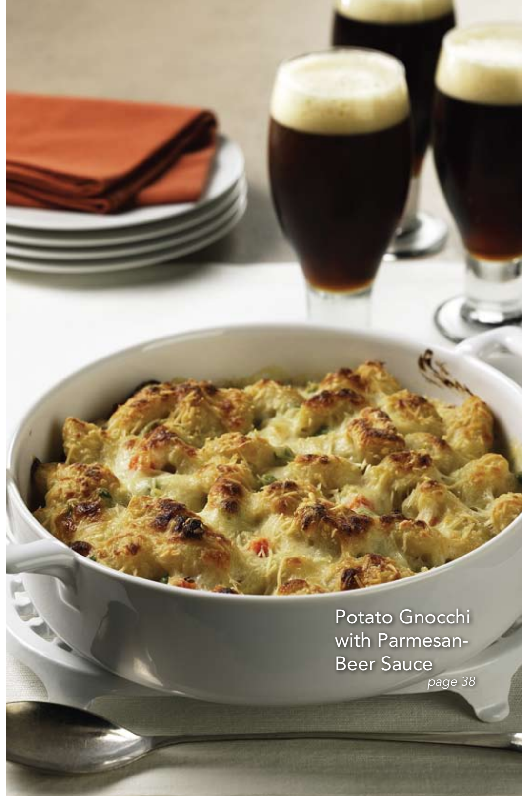
Potato Gnocchi with Parmesan- Beer Sauce

Nutrition Information, Per Serving: 440 calories; 26 g fat; 16 g saturated fat; 38 g carbohydrate