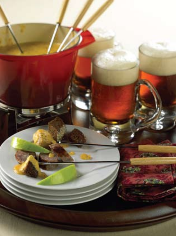
German-Style Beer Fondue page 7