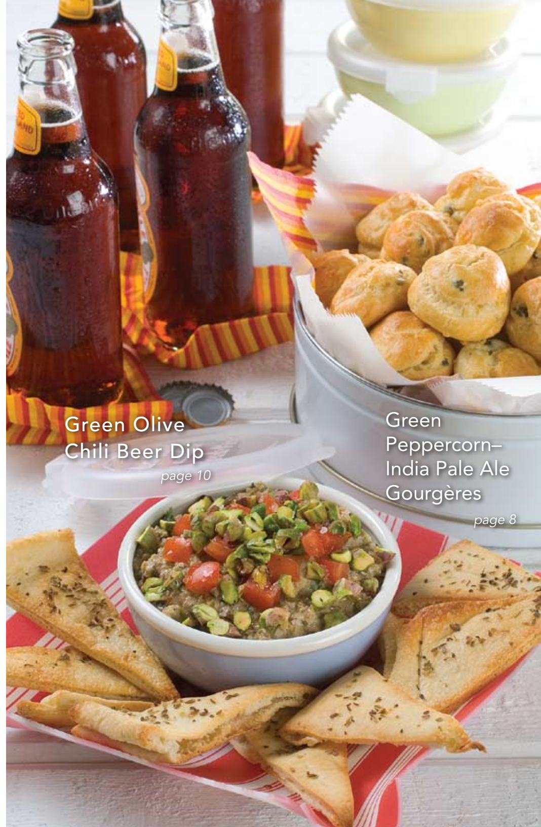
Green Olive Chili Beer Dip

Nutrition Information, Per Serving: 50 calories; 3.5 g fat; 2 g saturated fat; 2 g carbohydrate